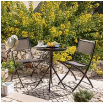
Above, garden furniture donated by the Inner Wheel Club of Manchester (District 5).

A collection of garden furniture has been purchased for a care home. I hope the residents enjoy sitting in the sunshine. Socially distancing of course!